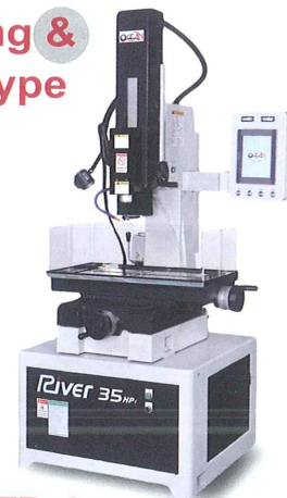
RIVER 35 ZNC Drilling EDM